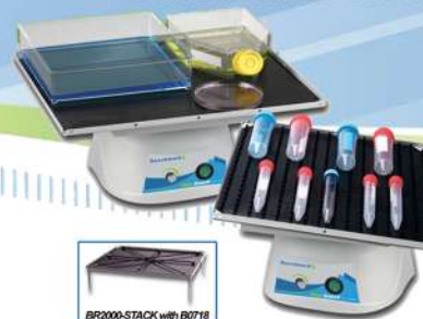
BR2000-E BenchRocker 2D Rocker with flat mat