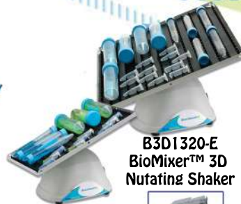
B3D1320-E BioMixer™ 3D Nutating Shaker